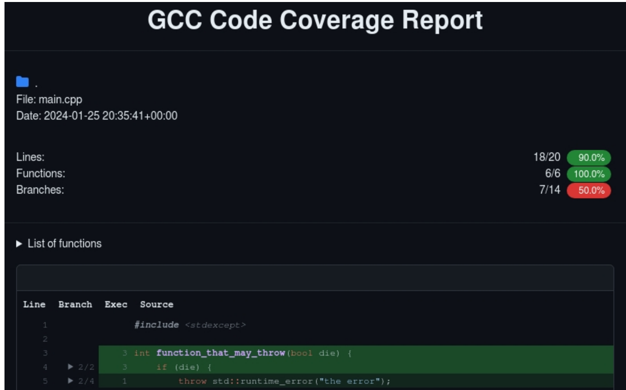
Fig. 5: --html-theme github.dark-green