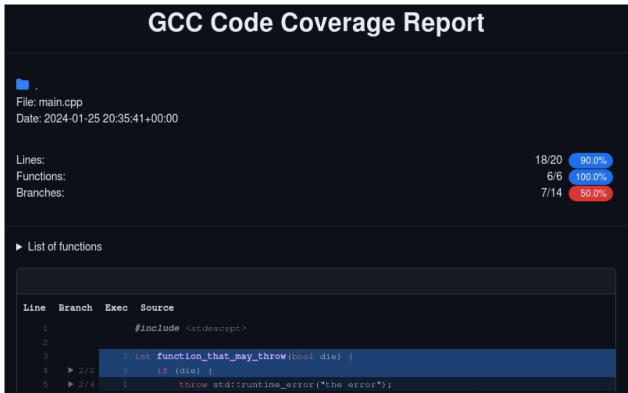
Fig. 6: --html-theme github.dark-blue