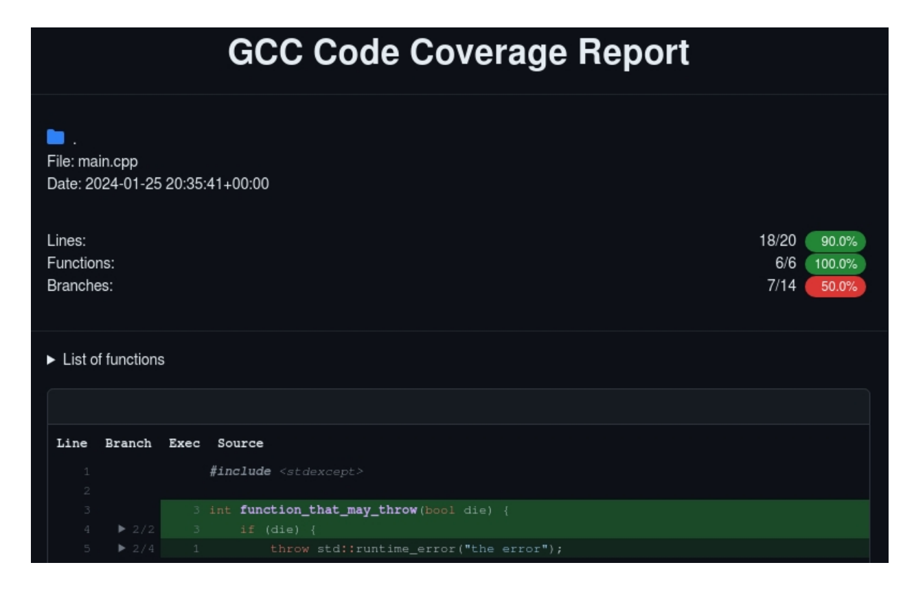
Fig. 5: --html-theme github.dark-green