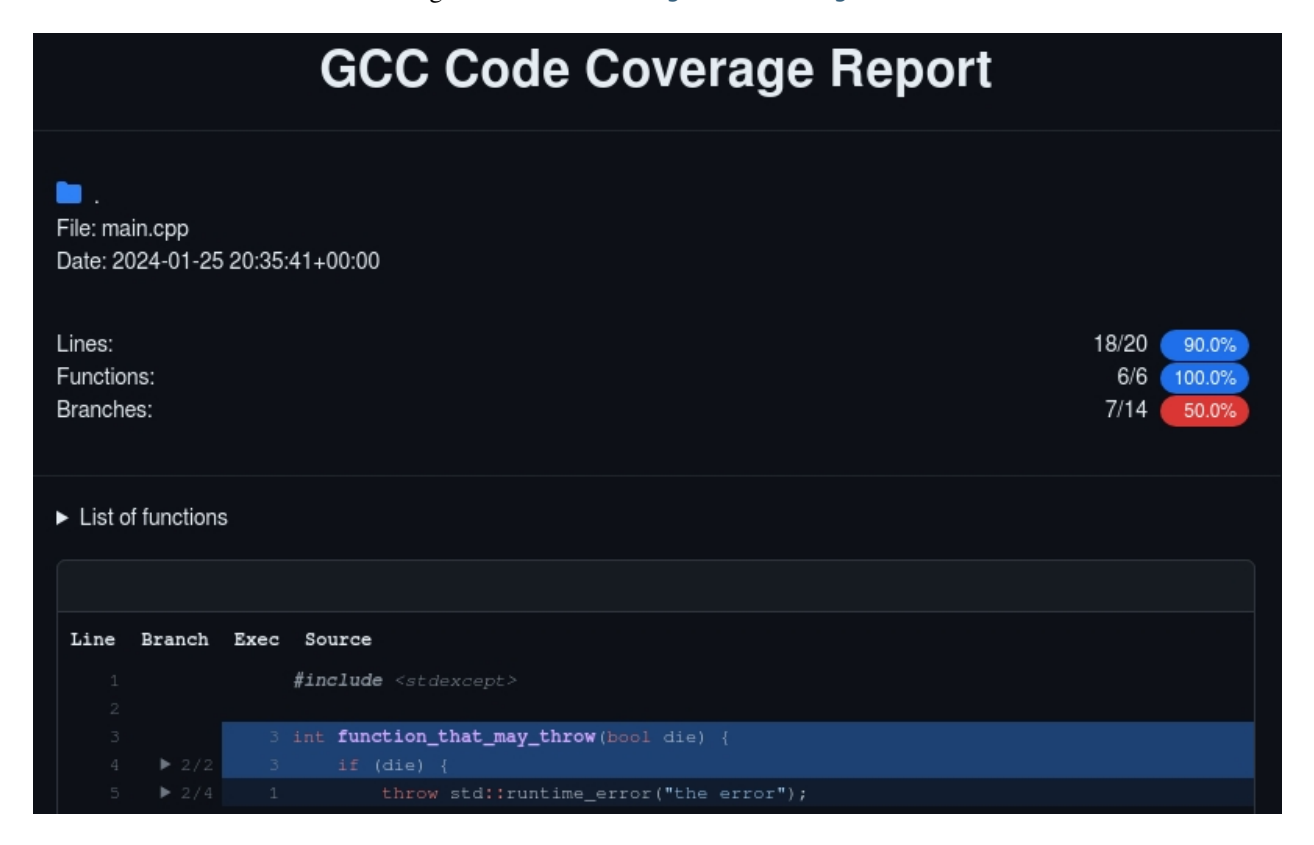
Fig. 6: --html-theme github.dark-blue